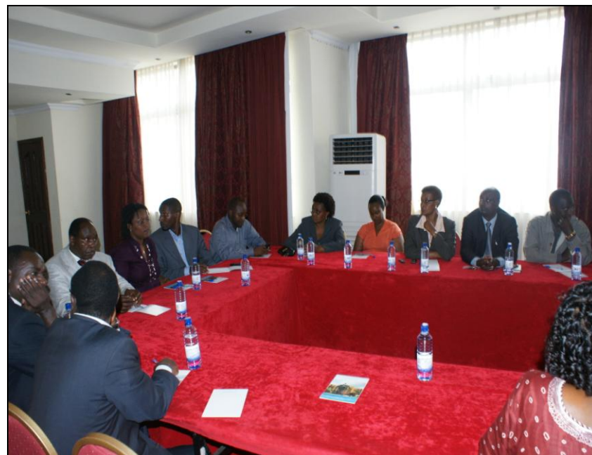
Abakomiseri bashya n'abarangije manda bakurikira ijambo rya Minisitiri

Yasabye kandi abakomiseri bashya gukomeza ikivi abandi batangiye kugirango bageze u Rwanda ku cyerekezo rufite kandi abizeza ubufatanye mu mirimo yabo. Uyu muhango ukaba warasojwe no kugenera impano abakomiseri bacyuye igihe bashimirwa ku bwitange n'umurava bagaragaje igihe cyose bari bamaze barahawe izi nshingano.